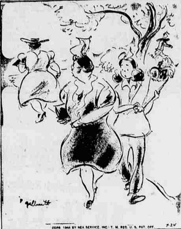
"The idea of her saying she and I must wear about the same size girdle! Does she really think she's as slim as I am?"