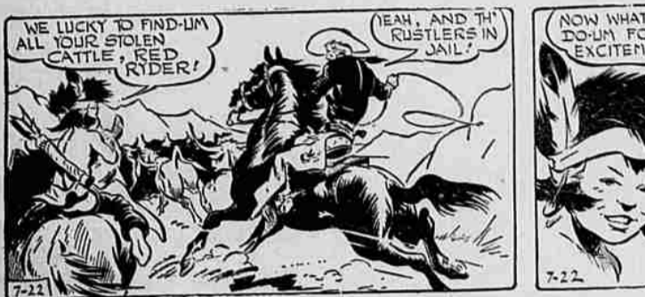
WE LUCKY TO FIND 'EM ALL YOUR STOLEN CATTLE, RED RYDER!