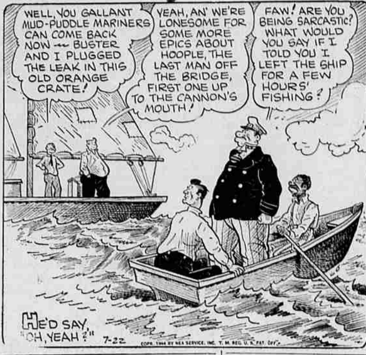
WELL, YOU GALLANT MUD-PUDDLE MARINERS CAN COME BACK NOW -- BUSTER AND I PLUGGED THE LEAK IN THIS OLD ORANGE CRATE!