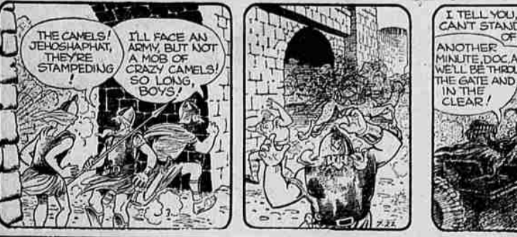
THE CAMELS! JENOSHAPAT, THEY'RE STAMPEDING!