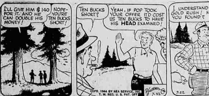
I'LL GIVE HIM $140 FOR IT, AND HE CAN DOUBLE HIS MONEY!