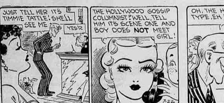
JUST TELL HER IT'S TIMMIE TATTLE, SHE'LL SEE ME