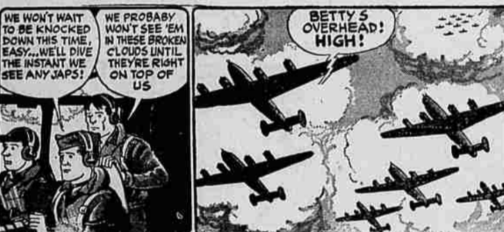
WE WON'T WANT TO BE KNOCKED DOWN THIS TIME, EASY...WE'LL DIVE THE INSTANT WE SEE ANY JAPS!