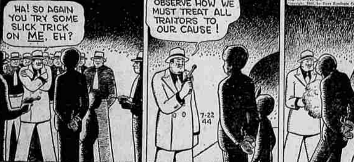
HA! SO AGAIN YOU TRY SOME SLICK TRICK ON ME, EH?