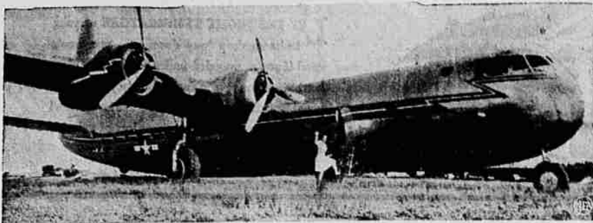
"Where you going for vacation?" "Oh, I think I'll hop over to Africa for a couple of weeks." That seems a likely prophesy of Mr. and Mrs. Joe Doakes' postwar planning, as promised by the plane pictured above. It's a Liberator Liner, commercial version of the B-24 Liberator bomber. Recently exhibited at La Guardia Field, New York, the four-engined Consolidated-Vultee craft has a range of 2500 miles, can carry 48 passengers and 1200 pounds of mail at a cruising speed of 240 miles per hour.