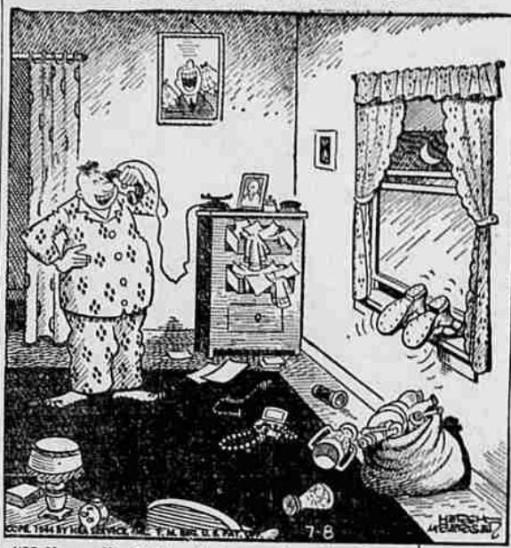
"Hello, police? I've just caught a burglar—come after him in about a week!"