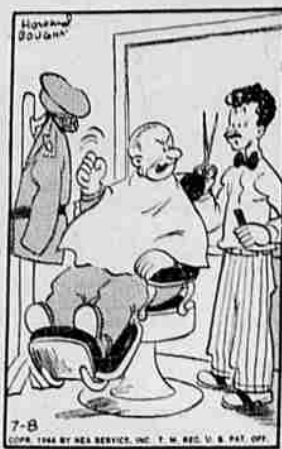
"Just a minute—I don't tell you how to cut hair, do I?"