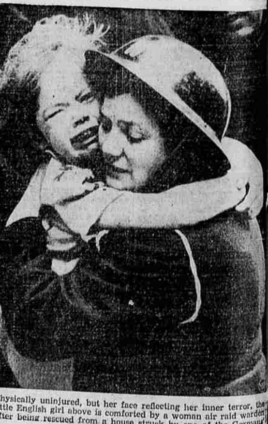
Physically uninjured, but her face reflecting her inner terror, the little English girl above is comforted by a woman air raid warden after being rescued from a house struck by one of the German new flying robot bombs.