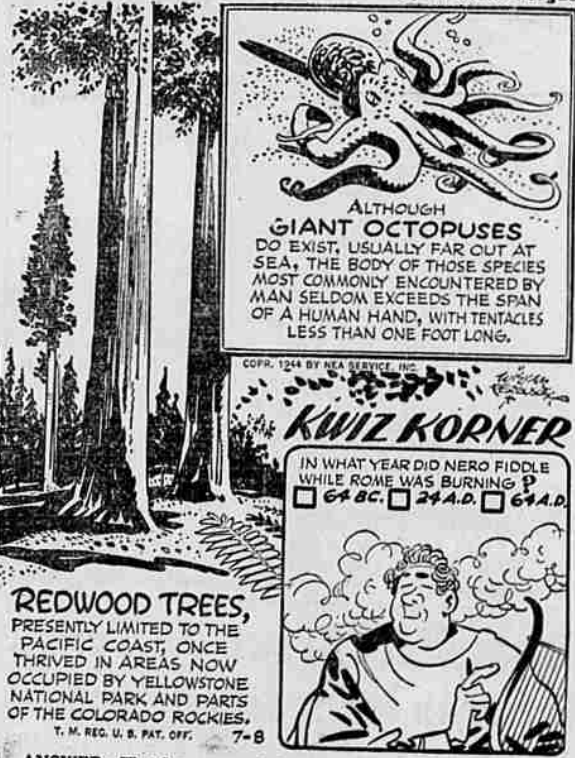
ANSWER: The fire occurred in 64 A. D., but if Nero played, it was not on a fiddle, for the fiddle hadn't been invented.