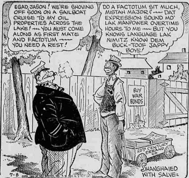
SHANGHAIED WITH SALVE

BIKES FOR RENT MAKE RESERVATIONS FOR SUNDAY Phone 5520 222 S. 7th Poole's Bicycle Store