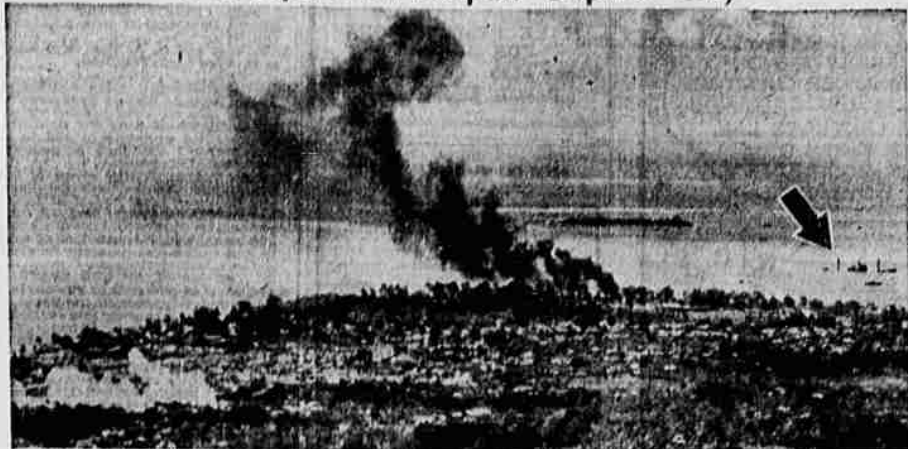
Leatherneck from the Second Marine Division—the conquerors of Tarawa—lighten via around this blazing coastal area, which was the city of Garapan, Saipan capital city. Fires caused by fleet bombardment can be seen as well as sunken Japanese shipping (arrow) in the harbor.