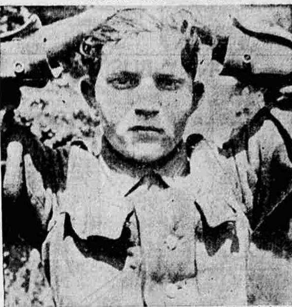
This Nazi, whose youthful face reveals his age as only 16, has been made a ruthless killer by German ideology. Thousands like him die for Hitler. He was captured by Yanks at Cherbourg.