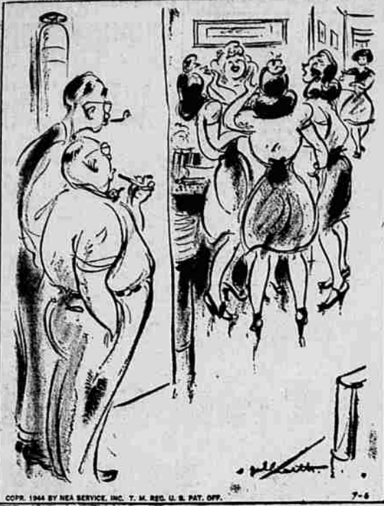
"Something about that huddle reminds me of the old days when one of our men came in off the road with a brand-new story!"