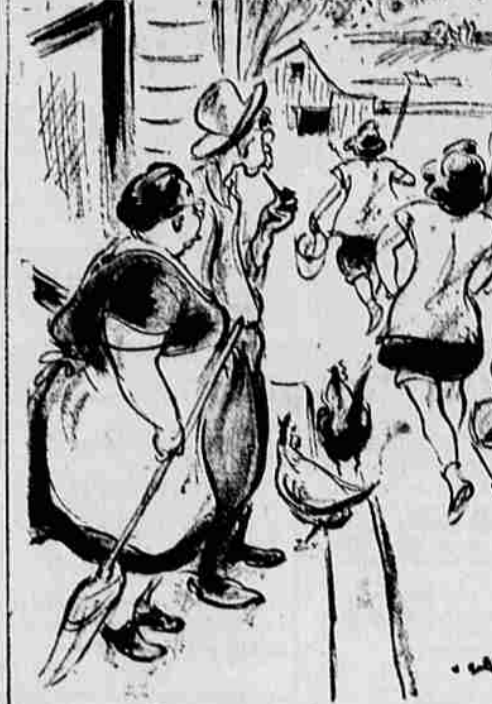
Those girls in the crop corps dress cool, all right, but I'd be afraid to wear a costume like that with the fields full of bees!