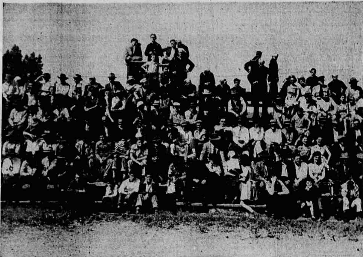
Part of the overflow crowd of Klamath Falls and Medford servicemen and civilians that witnessed the game last Sunday at the city recreation park.