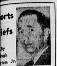
Beavers Win From L. A.; Oaks Halted