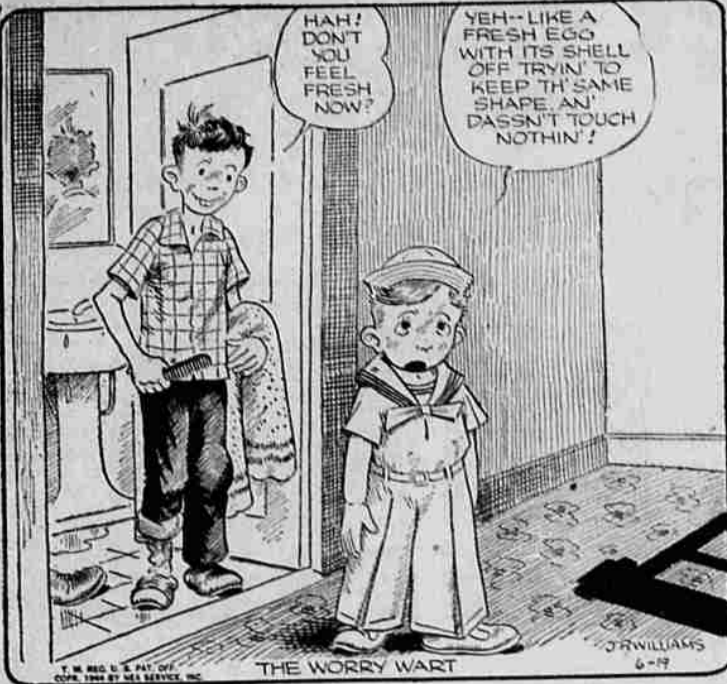
THE WORRY WART