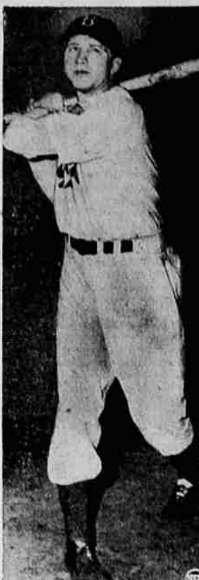
The Dodgers' floundering around the second division is no fault of Dixie Walker, who is leading hitters with a .407 average.