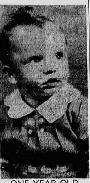
ONE YEAR OLD

The steel in a tricycle would make a shell for a 75-mm. howitzer, and that in an average baby carriage would make a .45-caliber submachine gun.