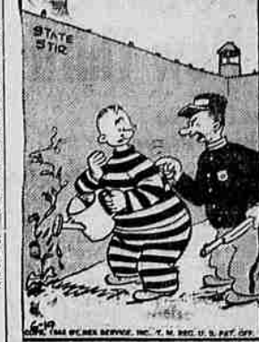
"The warden says stick to vegetables—climbing vines are out!"