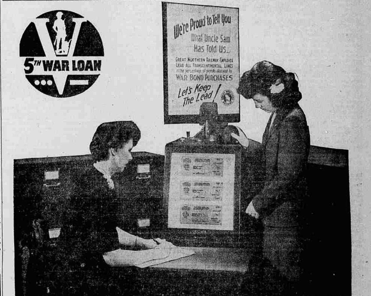
Issuance of War Bonds by the Great Northern necessitates full-time employment of 22 persons at company expense. Records of bonds issued are photographed on 16 mm. film. The machine above enlarges film records, enabling speedy check on inquiries.