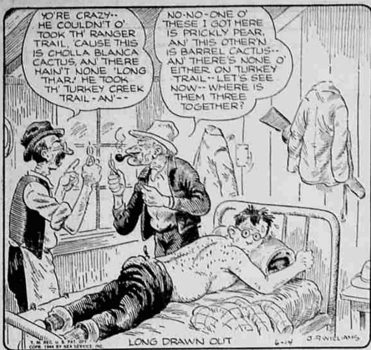
LONG DRAWN OUT