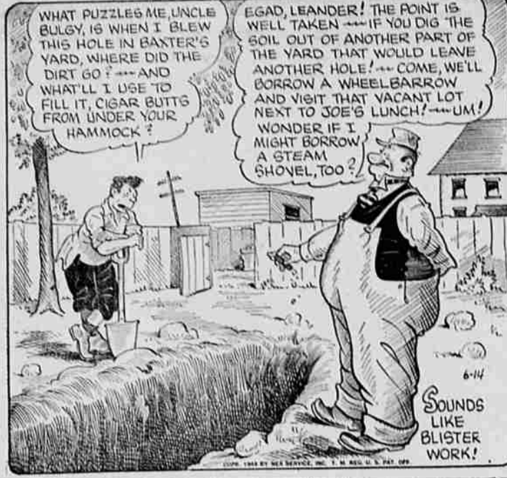
SOUNDS LIKE BLISTER WORK!