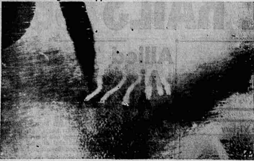
Pinpointed in wakes of spray, landing craft approach a beachhead on the northern shore of France on D-Day morning as the allies thrust against Fortress Europe. This reconnaissance photo is one of the first two showing invading forces on the French side of the channel.