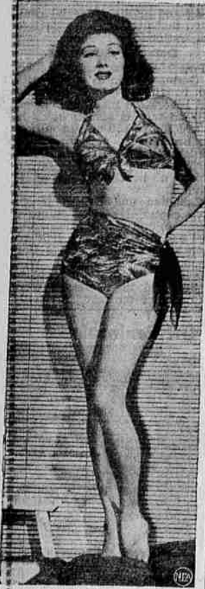
Jean Parker, above, curvilinear cutie of the screen, is the gal Army mail clerks in Italy say they would most like to play "Post Office" with.