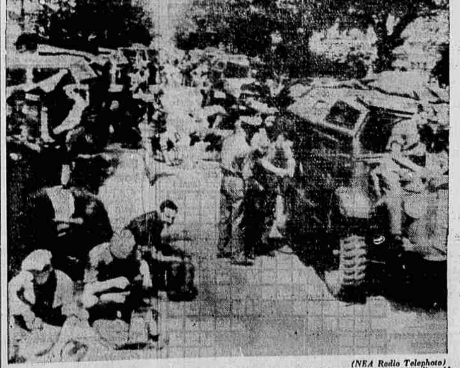
Invasion vehicles and their crews, impatient for signal that will send them against Germans guarding Atlantic wall, literally jam the streets of this English coastal village. Photo radioed from London. (NEA Radio Telephoto)