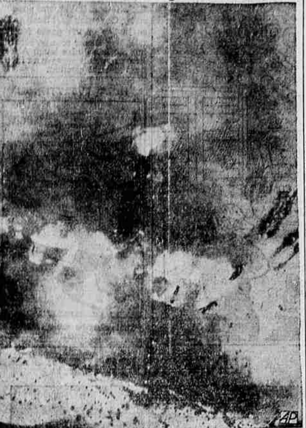
Men, barges, landing craft and assault vehicles reach the beachhead in France on D-Day of the allied landings on the continent of Europe. This is the first picture showing the allies on French soil.