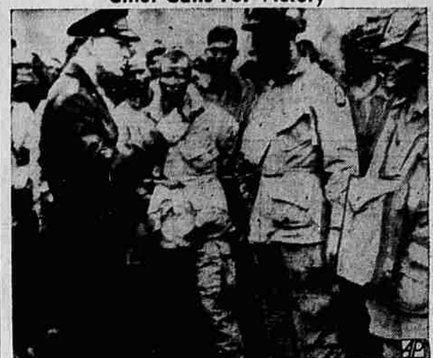
Gen. Dwight D. Eisenhower (left), allies invasion commander in chief, gives his order of the day—"full victory—nothing else"—to paratroopers somewhere in England just before they took off in planes for the D-Day invasion of France.