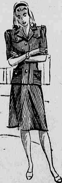
For Busy Days COTTONS 2.98