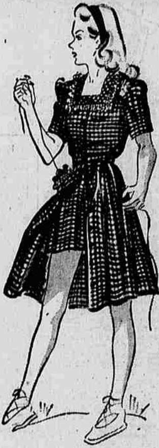
For Sun And Fun