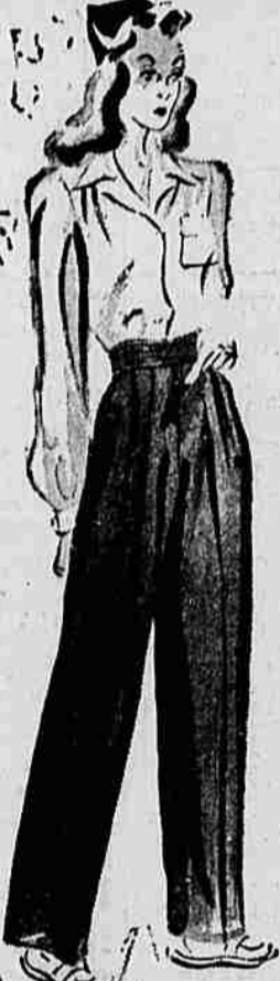
For Duty... Beauty SLACK SUITS 4.98 to 7.95