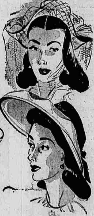
Sunny Summer HATS 1.69