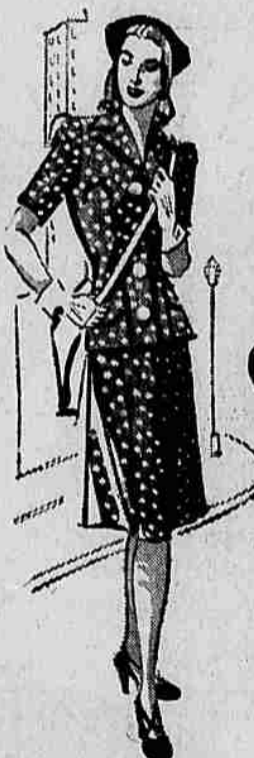
Gay Summery DRESSES 4.98