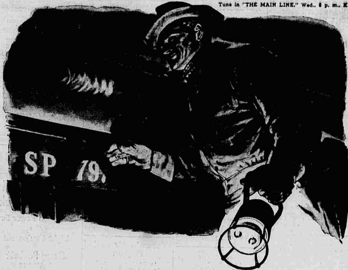
Tune in "THE MAIN LINE," Wed., 8 p. m., KPJI

Just the thing for a day in the sun! Shorts and shirt. Plus button-front skirt. 12-18. 4.29