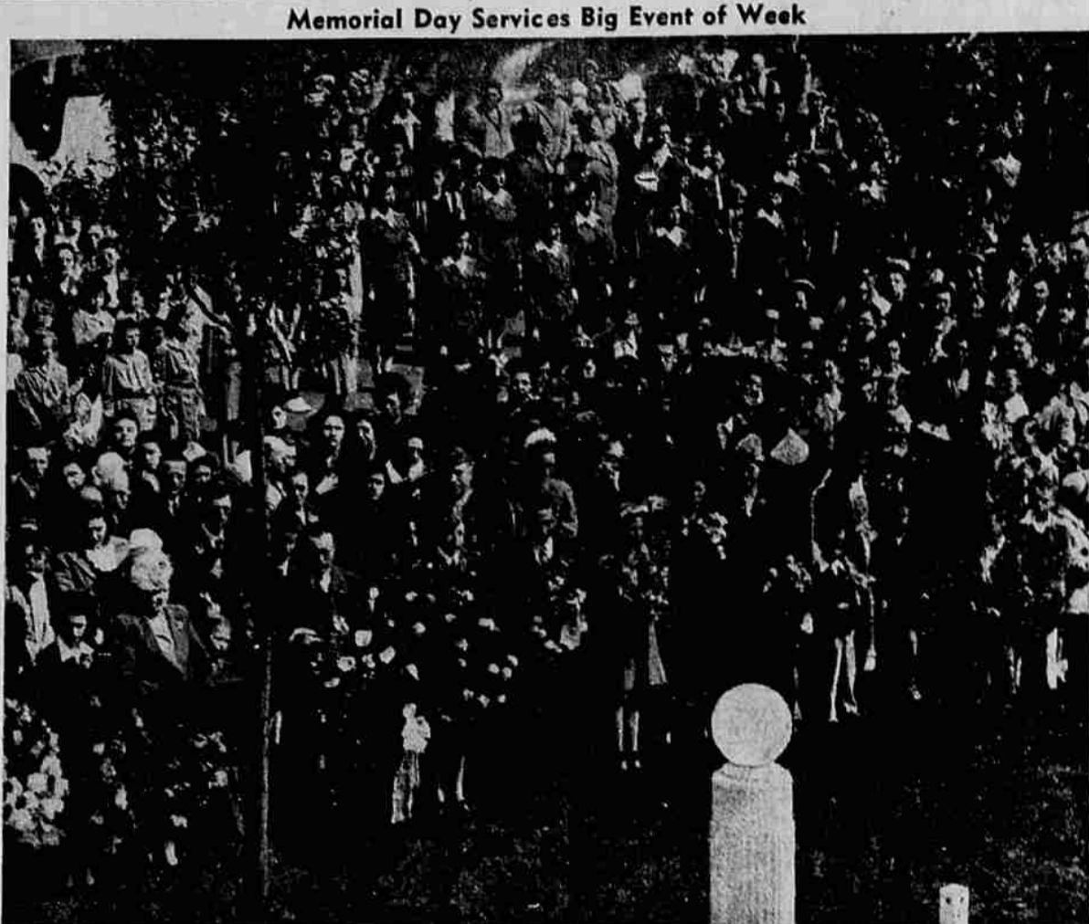
Major community event of the past week was Memorial Day services, which drew one of the largest crowds ever to attend such ceremonies here. Picture, taken by a U. S. navy air station photographer, shows a part of the crowd. Representatives of organizations and individuals are holding wreaths to be placed at the base of the courthouse lawn memorial shaft.