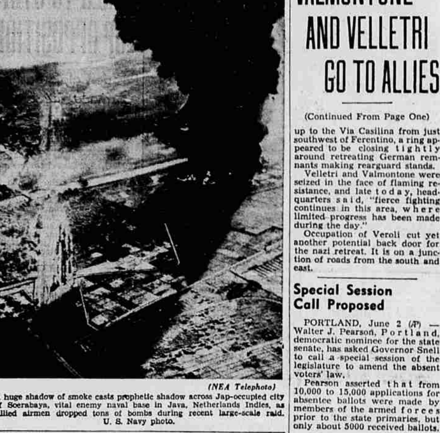
A huge shadow of smoke casts prophetic shadow across Jap-occupied city of Soerabaya, vital enemy naval base in Java, Netherlands Indies, as Allied airmen dropped tons of bombs during recent large-scale raid.