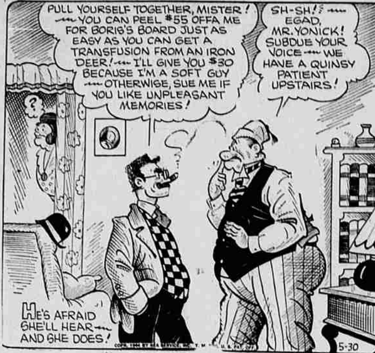
HE'S AFRAID SHE'LL HEAR AND SHE DOES!