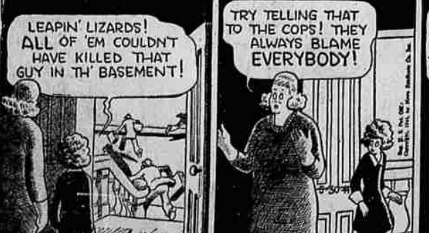
Little Orphan Annie