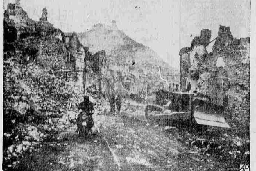
An allied bulldozer goes to work in front of the Hotel des Roses in Cassino on the day after the capture of the city. In the background is Hangman's hill, where heavy fighting occurred earlier in the campaign.