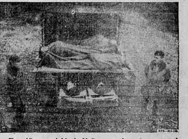
Five soldiers wounded in the Mediterranean theater are transported to a North African hospital on litters placed aboard a small Army truck. An Army doctor and the driver stand beside the vehicle. The Army needs many more doctors to give our fighting men the best possible medical care.