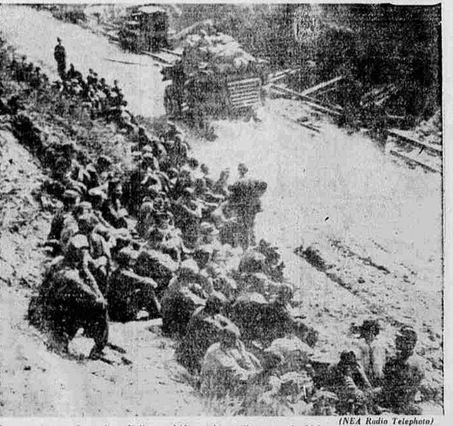
German prisoners of war sit on Italian roadside watching Allied armored vehicles speed onward to form junction between Fifth and Eighth Armies—the junction they had fought so many months to prevent.