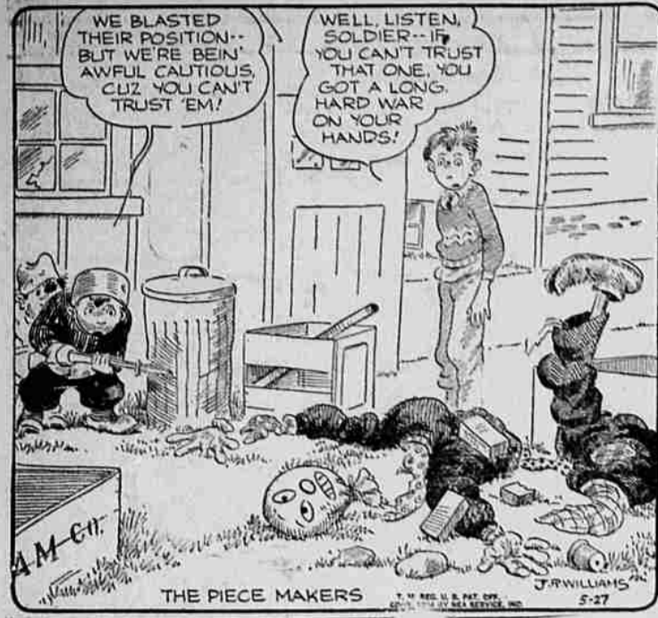
THE PIECE MAKERS