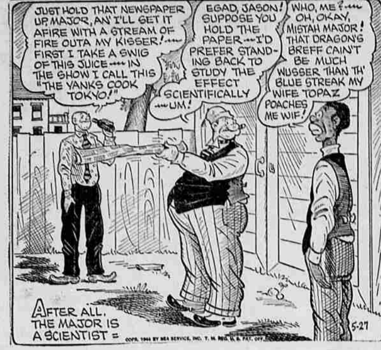
AFTER ALL, THE MAJOR IS A SCIENTIST