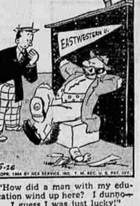
"How did a man with my education wind up here? I dunno—I guess I was just lucky!"