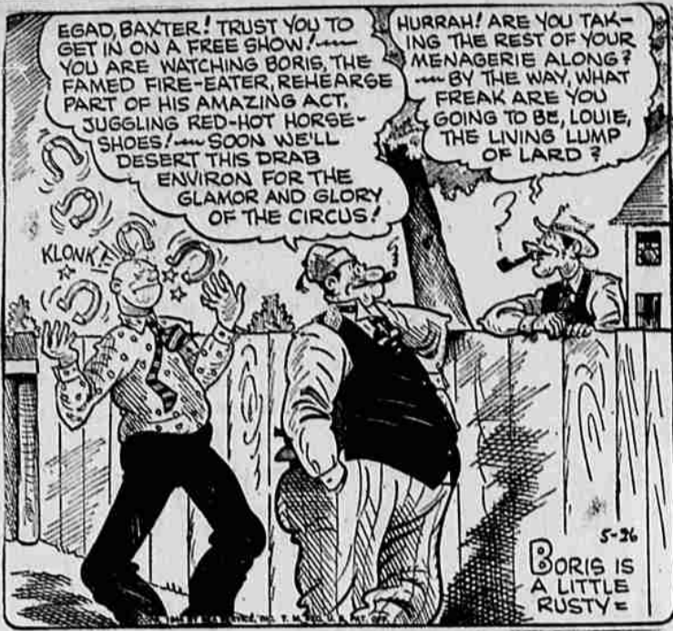
BORIS IS A LITTLE RUSTY