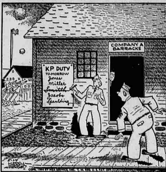
"They spelled my name wrong, so I crossed it off!"