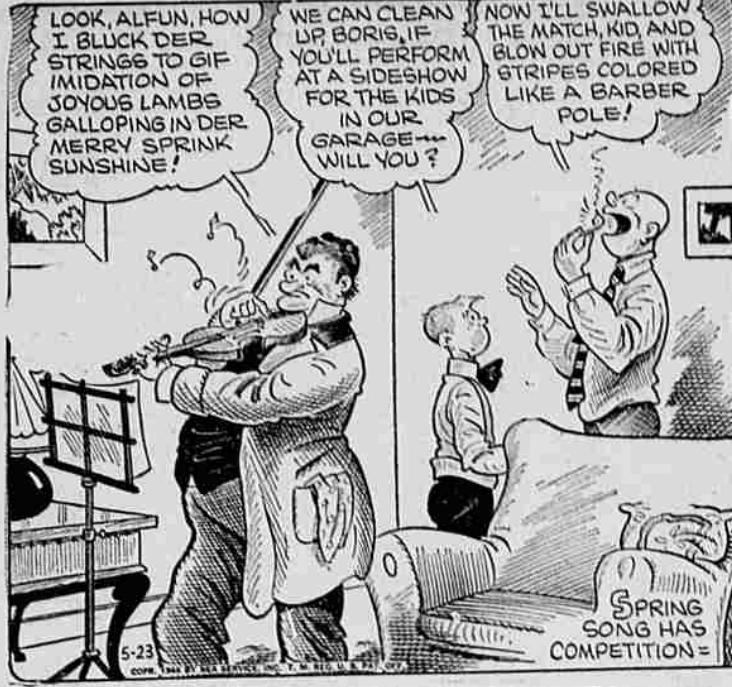
SPRING SONG HAS COMPETITION