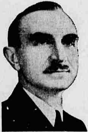
WAYNE MORSE Republican for U. S. Senate