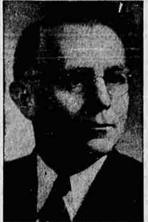
GUY CORDON Republican for U. S. Senate