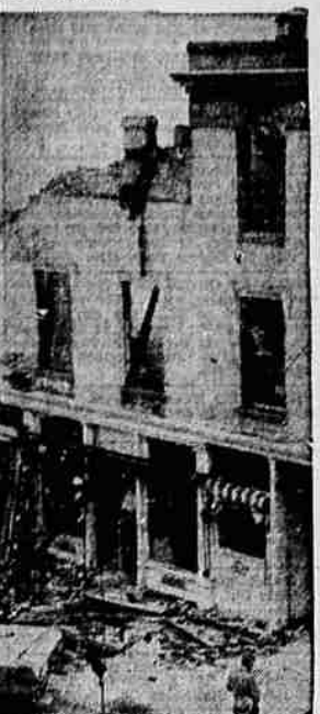
The ashes of this 50-year-old Union Hotel at Oroville, Calif., are searched by soldiers for three Chico Army airfield soldiers still unaccounted for after a $125,000 blaze swept the building, taking at least three lives.