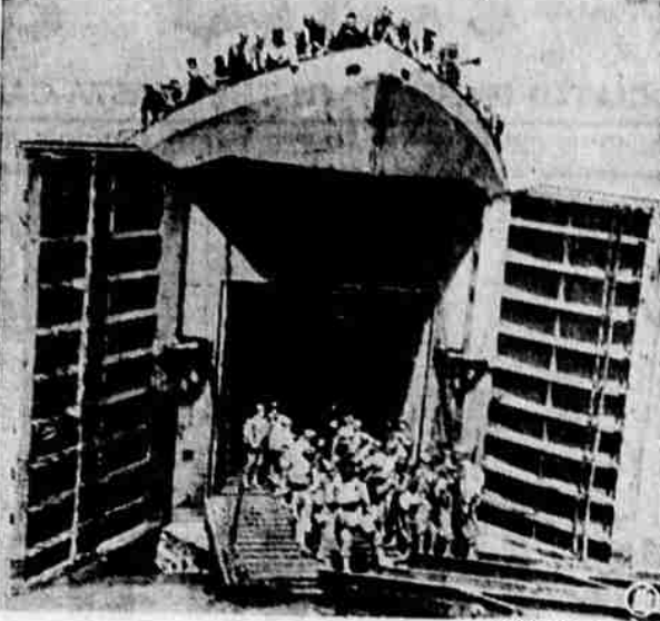
Through these doors pass the finest fighters in the world. Her huge doors swinging wide, a new American LST landing craft receives her complement of warriors en route to North Africa with Sicily as their eventual destination. This is the first time the well-guarded secret of the vessel's doors has been revealed to the public.