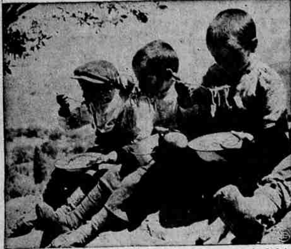
When war swept through their villages, Sicilian peasants fled to the hills—but life in mountain caves didn't spoil their appetite for a favorite Italian dish. Here Sicilian women whip up a meal of macaroni in a hillside grotto, and the children spearhead an attack on the food with well-aimed forks.