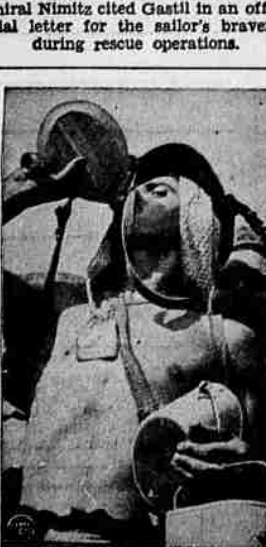
Thirsty Italian prisoner tilts the canteen high as he awaits transport to internment camp under the hot Sicilian sun.