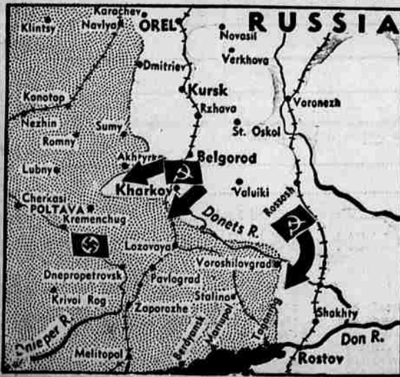
Here's the new line of the Russo-German front as the Nazis announced evacuation of the Ukrainian city of Kharkov and retreated in the face of the heavy Red drive. At the same time, a new Russian offensive south of Voroshilovgrad aimed at Taganrog was reported making headway.