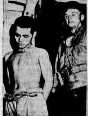
This sullen Jap Zero pilot, forced down on Vella Lavella in the Solomons, fell into U. S. hands by a roundabout route. Chinese plantation workers captured him, eluded other Japs on the island and turned the pilot over to Americans rescuing survivors of the U. S. S. Helena after Kula Gulf battle.