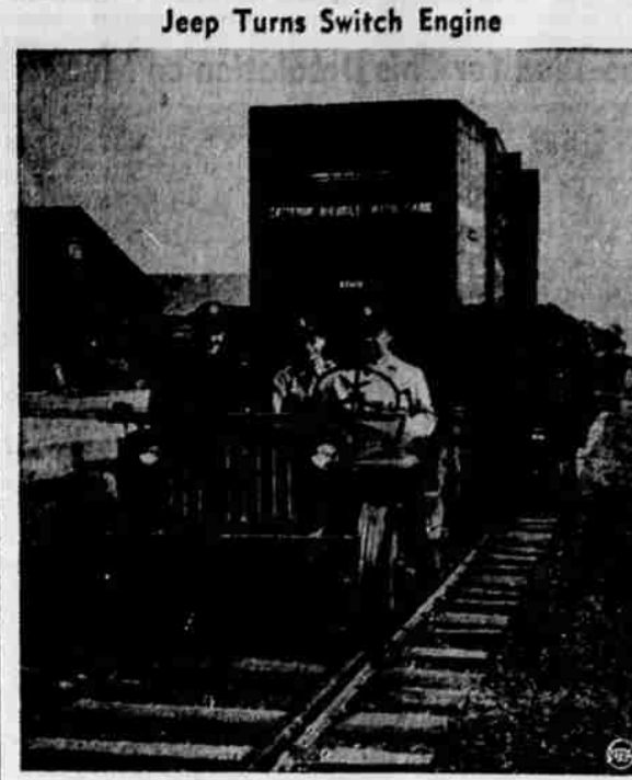
There's apparently nothing a jeep can't do. Down in Australia they've turned the versatile vehicle into a switch engine by substituting steel wheels for its regular rollers. Here the switch buggy hooks on to a long line of freight cars.

Jeep Turns Switch Engine There's apparently nothing a jeep can't do. Down in Australia they've turned the versatile vehicle into a switch engine by substituting steel wheels for its regular rollers. Here the switch buggy hooks on to a long line of freight cars.