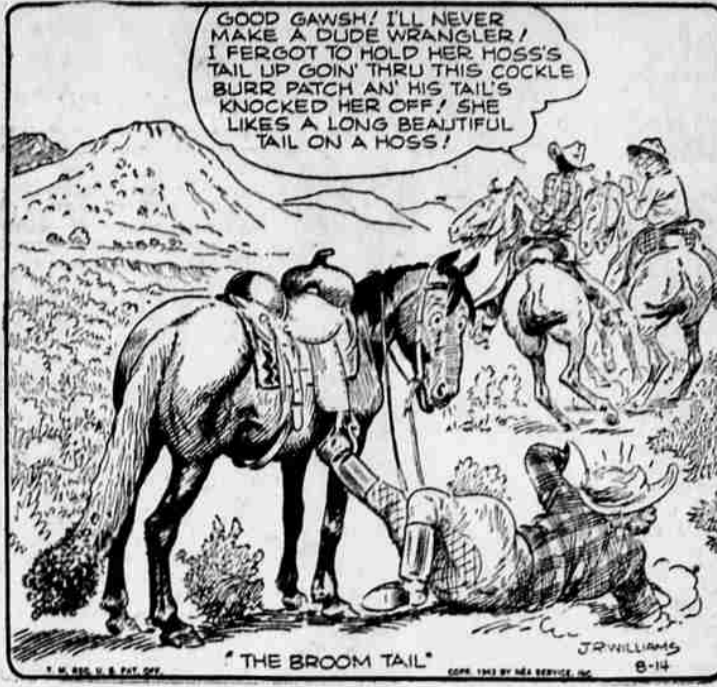
"THE BROOM TAIL" 8-14