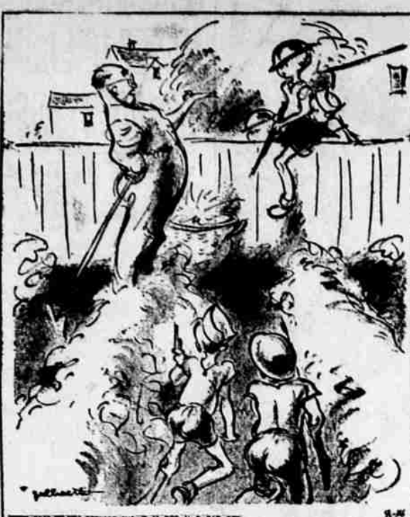
"I've thought up a brand-new game, kids—we'll pretend each weed in this garden is a Jap in the Aleutians!"