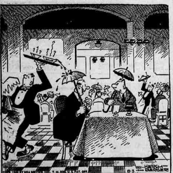
"Due to the shortage of experienced waiters, the restaurant supplies each customer with a neck umbrella!"