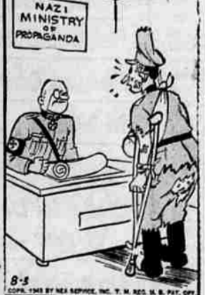
"Those of us who were left hurried back to report a smashing victory!"

a fatalist . . . "So," chimed in the Afghan, "am I! Wah—it is a pleasant fate which awaits me in Yebbal! A girl whose loveliness shames the splendor of the mid-day sun! I would ask her to be my wife—were I not off to the wars, joining the Sixteenth Pathan Brigade."