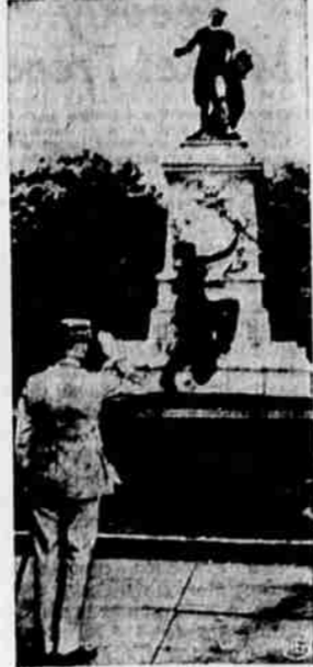
Gen. Henri Honore Giraud, commander of French forces in North Africa, pauses in Washington to salute the statue of the French hero, Lafayette.