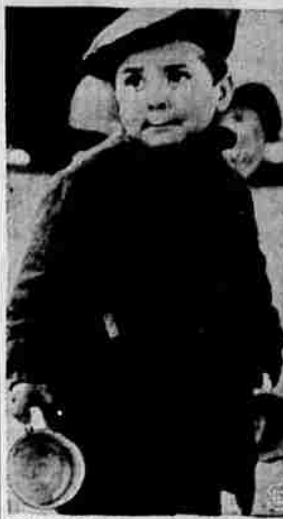
The hardships and sufferings of war are reflected in the face of this Greek refugee boy at camp in Egypt. Homeless Greeks are cared for near Suez Canal, then sent to new homes in Belgian Congo.