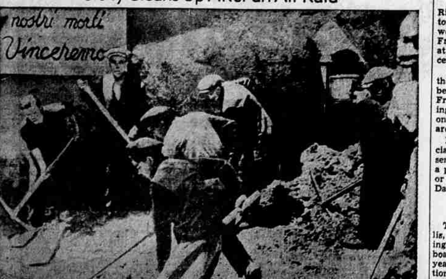
Clearing away air raid debris is getting to be a daily job in many towns on Sicily, where these workmen are pictured in photo received from neutral source. Note sign on wall of building, reading "In the name of our dead, we shall conquer."