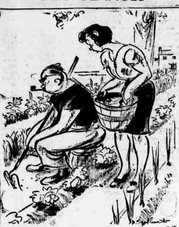
"Why, dear, how can you think of going to that stuffy resort for our vacation and leaving these vegetables all alone?"