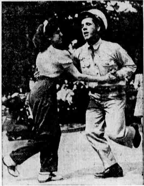
Serviceman and his slack-clad sweetheart cut a rug in Central Park to give music by Benny Goodman, at a block party sponsored by the second annual drive of "Records for Our Fighting Men."