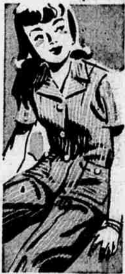
GIRL'S STURDY SLACK SUITS

What if you're not piling the family into the car these days and whisking away to the country? There's still no place like home! Drag those easy chairs out in your own backyard, and have fun there. And come to Wards for cool, comfortable sport togs that urge you to relax. Tubable, durable cottons you can toss in and out of the family wash without any worries. Gay playuits for Sis; shirts, slacks, shorts for brother and Dad. All kinds of clothes for Mother to look young and pretty in! And Wards prices won't put a dent in the family budget!