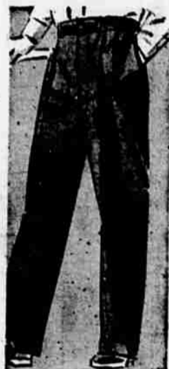
SLACKS FOR THE MAN WHO LIKES COMFORT

Get into one of these lightweight cotton shirts for real comfort this summer! Neat convertible collar; button-flap pockets. Patterns are woven-in—won't wear off!