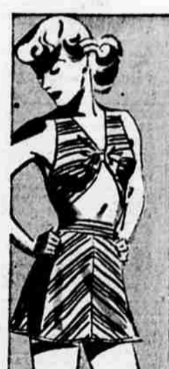
IT'S TIME FOR A NEW SWIM SUIT!

The long-wearing, good-looking slacks you want... amazingly low-priced at Wards! Choose yours in brown or navy. 24-32. Shirt in slub broadcloth... 79c