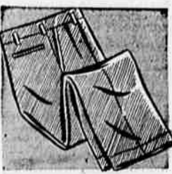
SAVE AT WARDS! BOYS' WASH PANTS 2.98

Four-color stripes, close or widely spaced... and in a fine combed cotton. Foot 10 1/2 to 12.