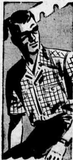
THESE SPORT SHIRTS WILL KEEP YOU COOL!