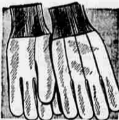
STURDY 12-OZ. CANVAS WORK GLOVES! P. 19c

"In-and-out" styles with new stitchless front. Easy-to-iron woven cotton fabrics. Full cut.