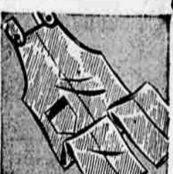
CHAMBRAY OVERALLS FOR LITTLE GIRLS 59c

You can tub these Sanforized cottons all you want—they won't shrink more than a tiny 1%!