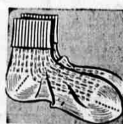
ANKLETS IN THE GAYEST NEW COLORS! P. 25c

And whether you want a fitted rayon satin lastex or a gayly printed cotton, you'll find it at Wards for so little! Sizes 32 to 40. Lots of colors!