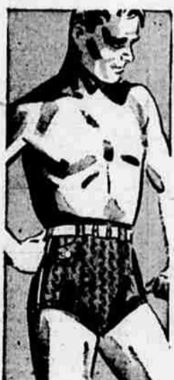
MEN! GET IN THE SWIM WITH TRUNKS THAT FIT

Sizes 8 to 16. Low Ward price for smartly tailored jackets and well made slacks in good, long wearing sports cottons. In becoming blues. Tub alone.