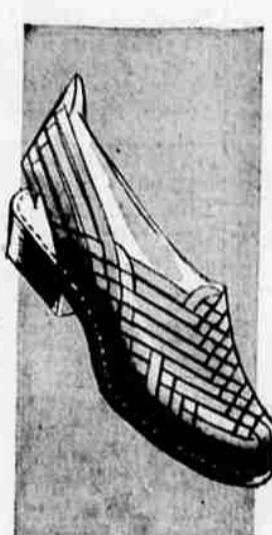
WOMEN'S WOVEN LEATHER HUARACHE

Cool summer fabrics. They're carefully tailored with narrow waistband, cuffs, pleats! Smart rayons or rayon and cotton! Some are Sanforized—99% shrinkproof!