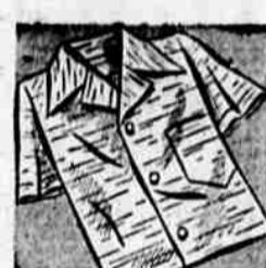
BOYS' SPORT SHIRTS—COAT STYLES 79c

Novelty Rib! Classic and fancy knits in fine mercerized yarns and rayons. 6 1/2-10 1/2.