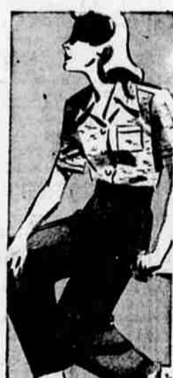
THESE ARE SPUN RAYONS! ONLY

Woven with fastex! That's why they hug your body so comfortably. Fit so sleekly! Made with knit supporters. One style has flap pocket, woven belt! Rayon blends!