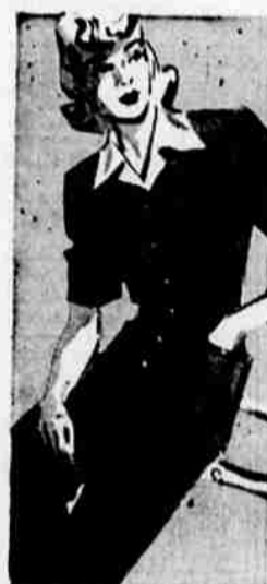
STUNNING SLACK SUITS FOR ONLY

When pulling weeds in your private Victory garden or loafing in the shade... wear these comfortable, soft leather huaraches. Be sure you have a pair!