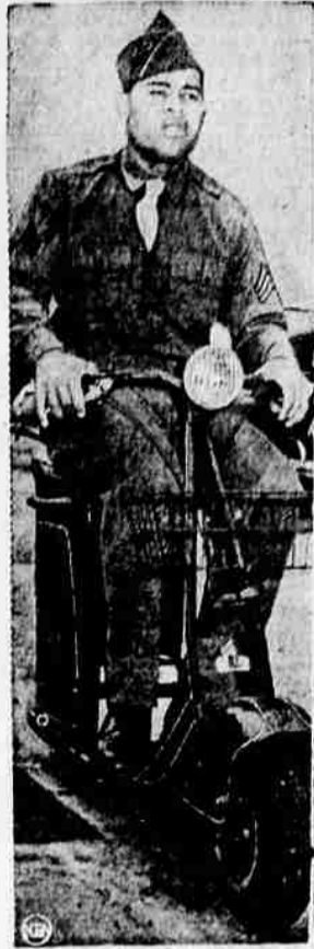
Sgt. Joe Louis, in Hollywood appearing in screen version of "This is the Army," gets around movie lot on motor scooter.