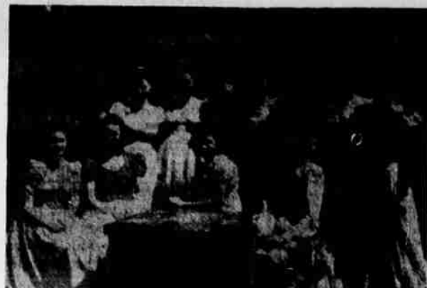
VENTURE CLUB TEA