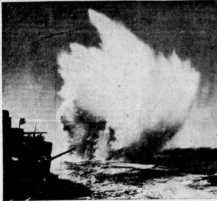
It's bye, bye U-boat in the North Atlantic when a destroyer turns loose the depth charges—a big factor in the falling off of convoy losses. Here a gunner hoists the "ashcan" to rack; then it is fired and explodes in a geyser of spray.