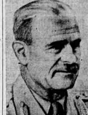
Field Marshal Archibald P. Wavell, named viceroy of India.