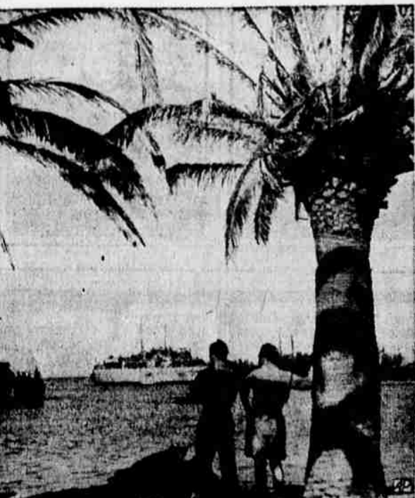
ALLIED HARBOR NOW—Framed by palm trees in this view, American and British ships ride at anchor in the harbor at Bizerte, Tunisia, where Axis vessels once held sway.