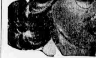
Face the Future With Eyes Right!

NEW DELHI, June 14 (P)—American and British planes operating from Indian bases carried out a series of widespread and destructive raids yesterday on Japanese troops, military installations and rolling stock in Burma.