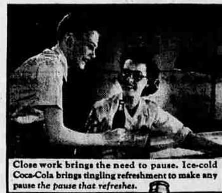
Close work brings the need to pause. Ice-cold Coca-Cola brings singling refreshment to make any pause the pause that refreshes.

When you add refreshment to a rest-pause, you not only have a pause that rests, but refreshes, too. A moment for ice-cold Coca-Cola makes a rest-pause take on more meaning... promoting contentment that leads to more work and better work. Yes, contentment comes when you connect with a Coke.