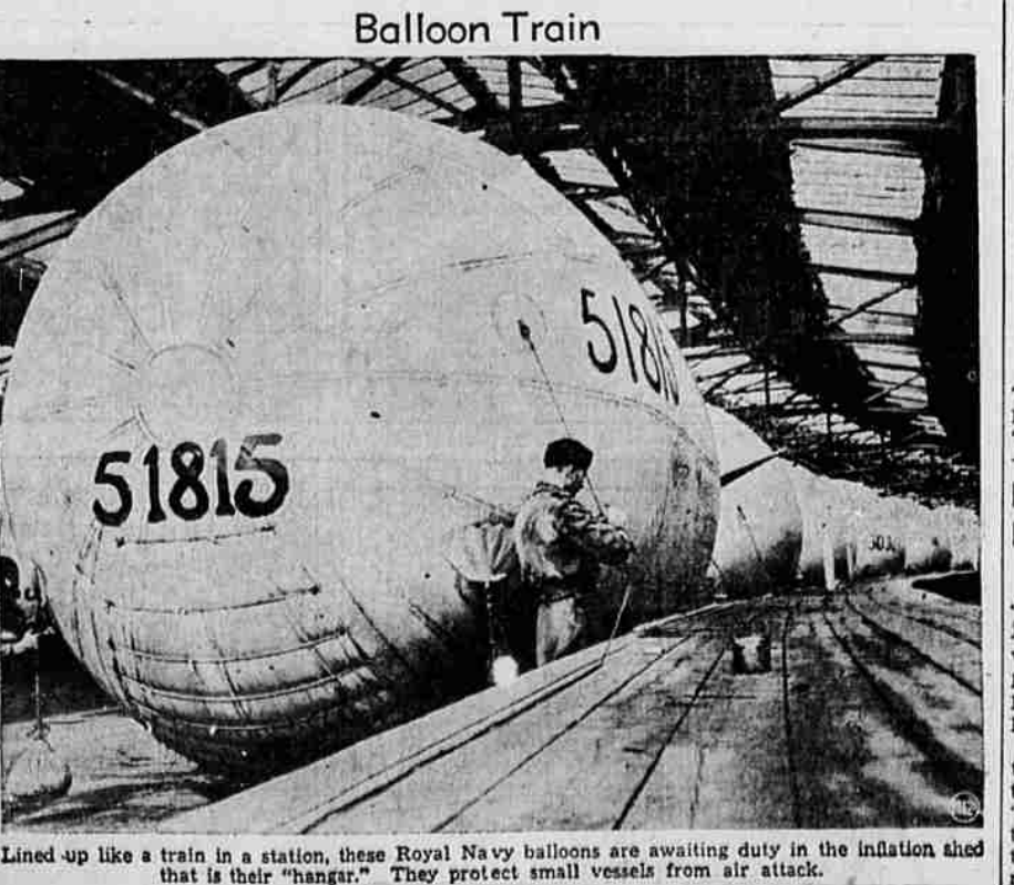
Lined-up like a train in a station, these Royal Navy balloons are awaiting duty in the inflation shed that is their "hangar." They protect small vessels from air attack.