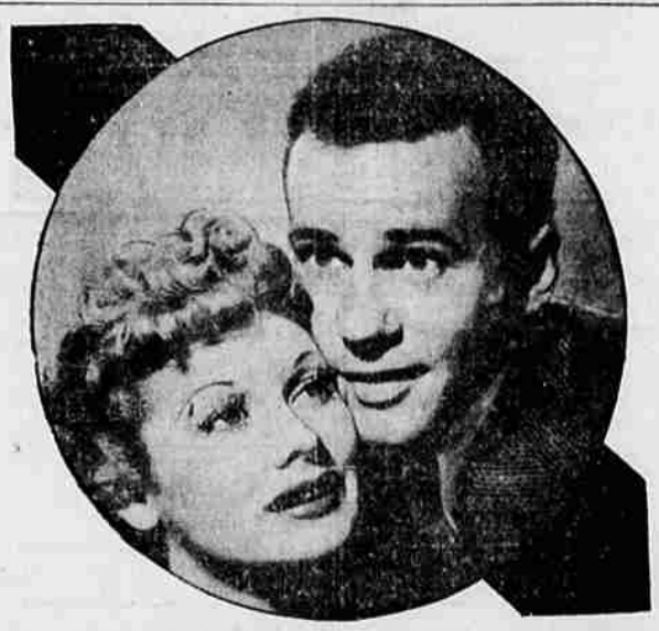
Lucille Ball and Richard Carlson are starred with Ann Miller in the riotous comedy romance, "Too Many Girls," which opens with "I Was Framed" tomorrow at the Pine Tree Theatre.