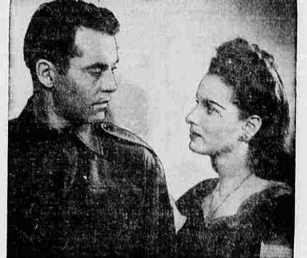
Henry Fonda and Maureen O'Hara have the romantic leads in "Immortal Sergeant," the Twentieth Century-Fox Film's special production based upon John Brophy's best selling novel. Others in the cast are Thomas Mitchell, Allyn Joslyn and Reginald Gardner. It opens tomorrow at the Esquire.